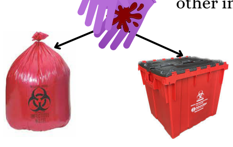
The disposal of blood contaminated gloves

Biologically contaminated gloves contaminated with blood, bodily fluids, or other infectious materials should be placed in regulated medical waste bins.